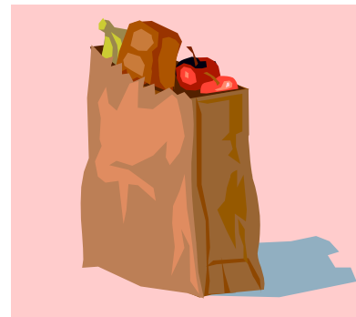
Kenwood Park SHARE Iowa News